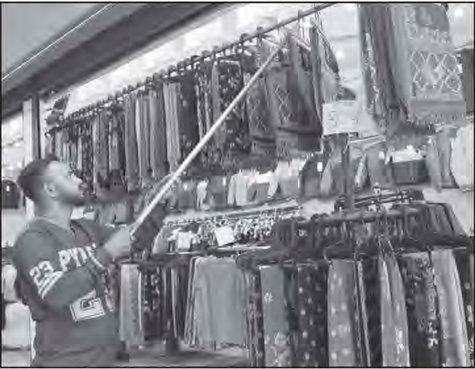
Shopkeeper arranging woolen clothes at his shop after start of winter season in Agartala on Friday